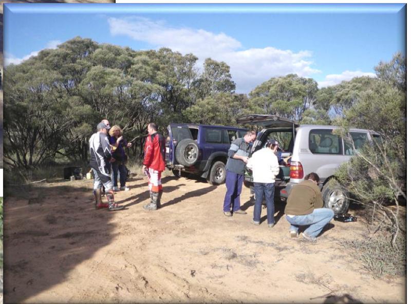
Above, rest and a BBQ after a trip to Milmed Rock Wyperfeld National Park.