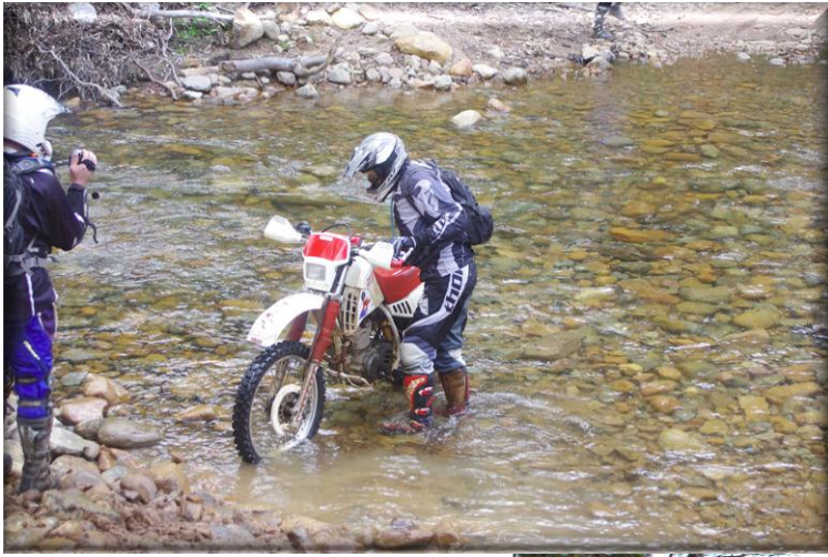
Above, a little assistance required at the King River