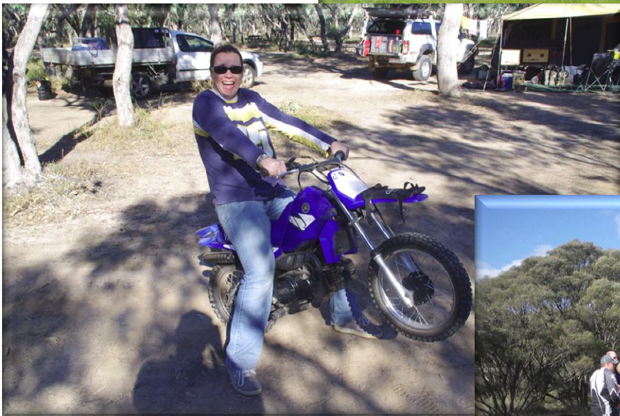
Left, even adults can play on the kid's bikes.