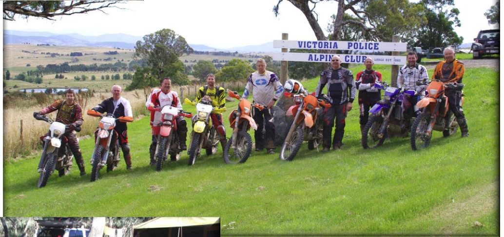
Right, nine intrepid riders with one injured party sook-ing up out of frame.